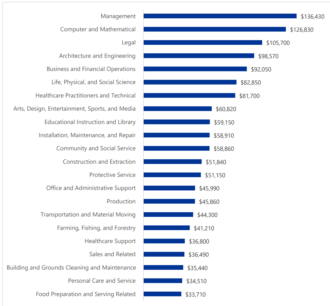
Figure 3: Median Salary by Major Occupation Group

It is important to consider employment and wage trends across regions of Virginia. Figure 4 gives employment and wage statistics for Virginia's fourteen Local Workforce Development Areas (map shown in Appendix B ). As expected, the regions with the highest employment were the Northern Region (1,032,120), the Hampton Roads Region (748,660), and the Capital Region (588,240). The Alexandria/Arlington Region had the highest wages with a mean annual wage of $102,380 and a median wage of $81,620. The West Piedmont Region had the lowest wages with a mean annual wage of $51,130 and a median annual wage of $41,530.